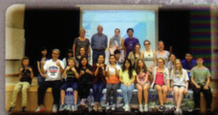
Students and teachers kicked off the Hong Kong exchange visit with a sharing session in the school hall.