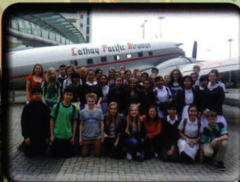
LSS students enjoy exchanging cultures with visiting German students at Hong Kong's Cathay City.