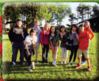
SVHS students get to know their HK counterparts during the US exchange programme.