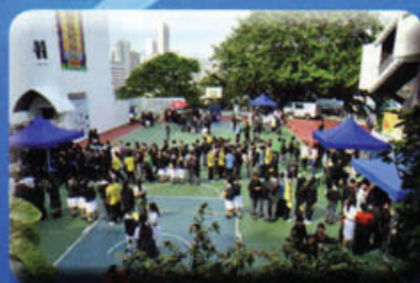
The playground was a hive of activity amid the Game Stall Day excitement.