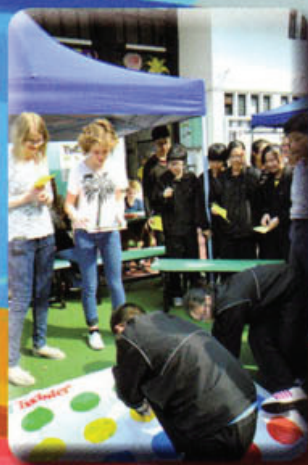
Visiting German students look on as their Hong Kong buddies participate in one of the fun game stall activities.