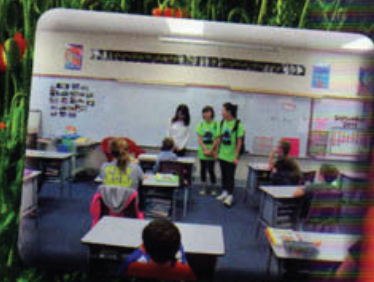
LSS students share their experiences with the class at SVHS in Indiana, the US.