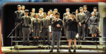
Class 3D display great poise as they perform during the Singing Competition.