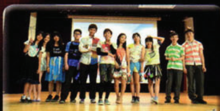
Junior Form prize winners show off their fantastic designs during the LSS 55th Anniversary Fashion Show.