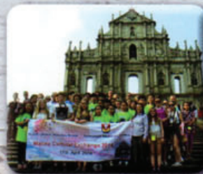
Students pose in front of Macau's iconic Ruin of St. Paul's.