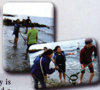
Hong Kong and German students participate in a beach ecology activity on the German leg of the exchange programme.