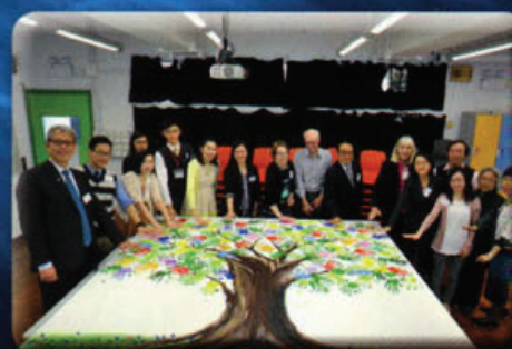
Invited guests and LSS members constructed a special tree to symbolize the concept of Invitational Education.