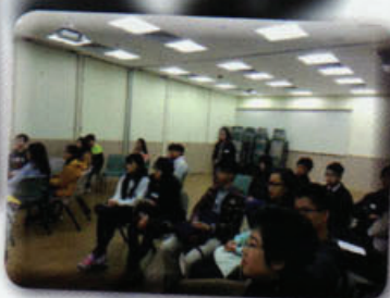
Teachers and students listen intently to the pre-activity briefing.