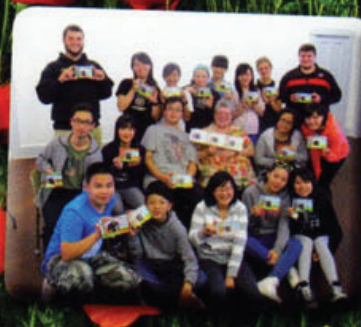
HK and the US students shared cultural differences and formed lasting friendships on their 2013 exchange tour.