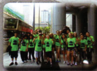
Students visit the famous HSBC building during their Hong Kong discovery tour.

In the ten days that they stayed, there were three days in which to go to the school with us to have lessons and game stalls. In addition to learning there was playing and exploring also! We went to Macau and visited different hotels, temples, shops and enjoyed different Portuguese national dishes. We went to The Peak and Stanley to enjoy the beautiful views and buy some souvenirs there. We also visited Cathay City to gain knowledge about aviation. After that we had a buffet dinner in Cathay City too.