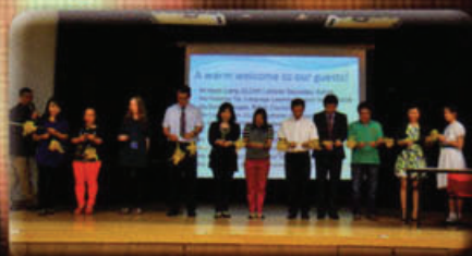
Special guests from the PTA, EDB and Alumni Association join the principal in officially opening the Independent Learning programme.