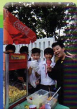
Students enjoy a well-earned reward after a busy but very enjoyable English Game Stall Day.