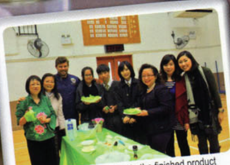
Invited special guests taste the finished product at Chef Ford's cooking demonstration.