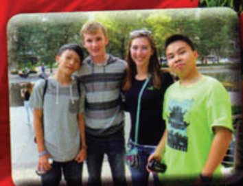
SVHS students show the LSS visitors some of the sites of their beautiful city.