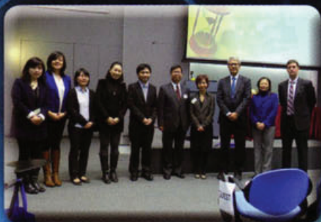
LSS representatives meet Hong Kong Education Bureau members at the Education Bureau sharing session in March this year.