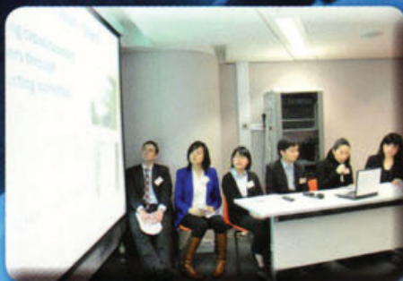
LSS Independent Learning Committee members present to educators from across Hong Kong at the EDB sharing session.