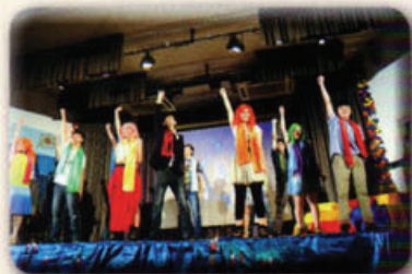
The cast perform an energetic routine from the LSS school musical, "Life is Sweet."