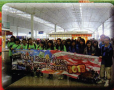
Excited LSS students arrive in the US to begin their exchange tour.