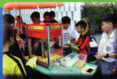
Student helpers assist teachers to present popcorn and cotton candy to eager prize winners.