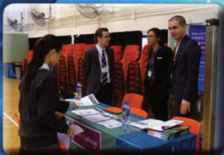
Students visit the display stalls as they consider the Irish education options present during the Irish Education Fair.