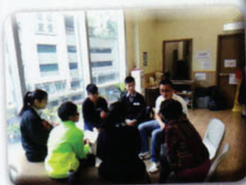
Student representatives from a number of schools across Hong Kong participated in the Language Café discussion groups.