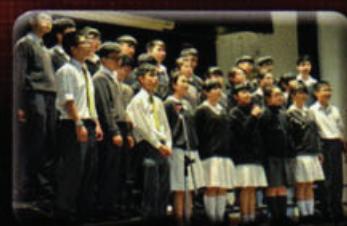
Class 3C harmonizes during their performance in the junior form singing competition.