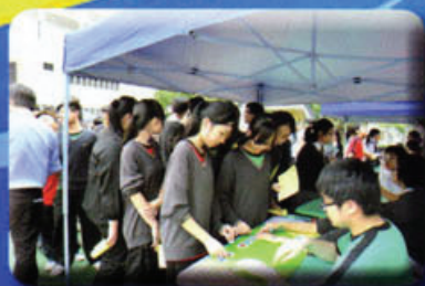
Game Stall student attendants were kept busy during the day with many fellow students keen to take part.