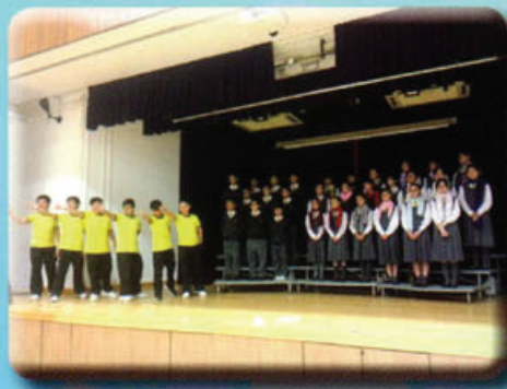
Class 1A warm up before attaining a very impressive 3rd place award in the Hong Kong Schools Speech Festival, Choral Speaking division.

Before the Solo Verse competition I practised a lot. This was the first time for me to join the Speech Festival, but I didn't feel nervous. I have been in other competitions before. The judges awarded me third place overall.