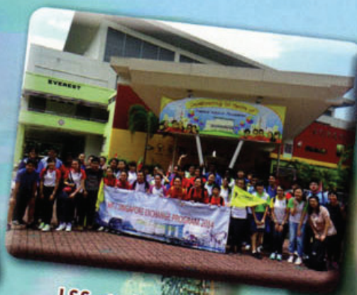
LSS students pose with students from Pui Tak Canossian College on their visit to Ping Yi Secondary School.