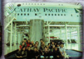
Students visit the safety procedure instruction centre at Hong Kong's Cathay City.