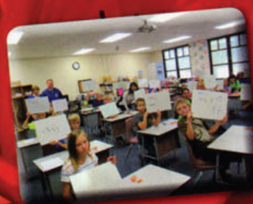
SVHS students display their skill at writing in Chinese during a lesson from visiting LSS students.